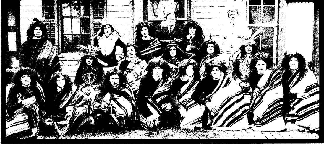
Council No 212, Improved Order of the Society of Red Men, Catasauqua, 19xx

The fraternity traces its origins back to 1765 and is descended from the Sons of Liberty. It was established to promote liberty and freedom in the early colonies and to defy the tyranny of the English Crown. They patterned themselves after the great Iroquois Confederacy and its centuries old democratic governing body, composed of elected representatives to govern tribal councils.